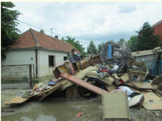
Obrenovac, Household goods destroyed in floods