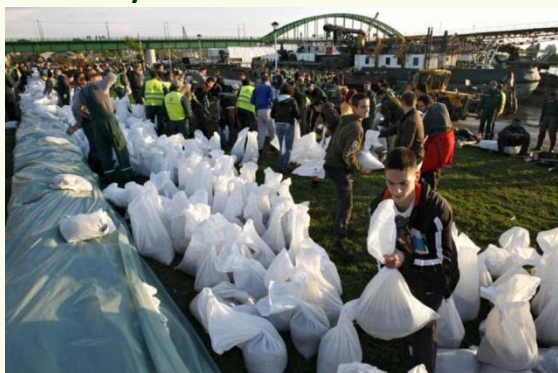
Defense of the city of Sabac