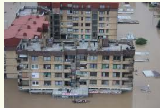
Flooded apartment blocks